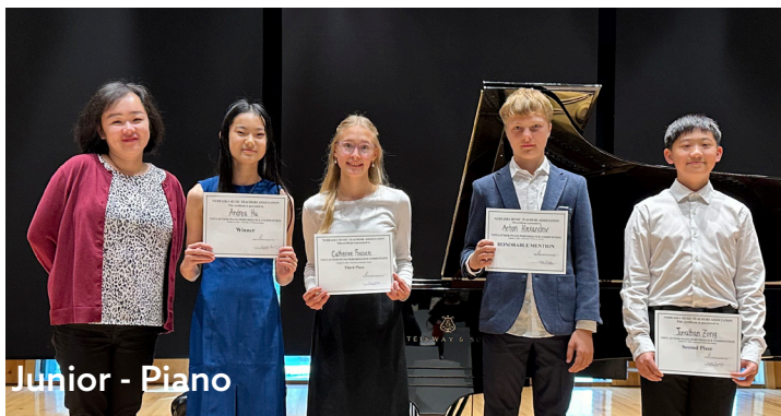
Junior - Piano