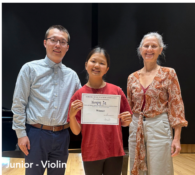
Junior - Violin