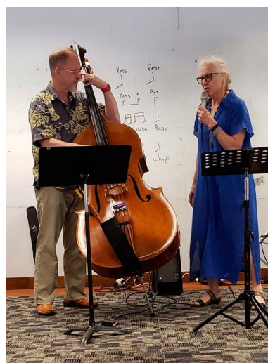
BASS MEETS VOICE